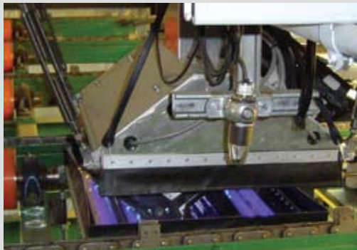
Above: The sensor head assembly is easily integrated into your existing equipment.